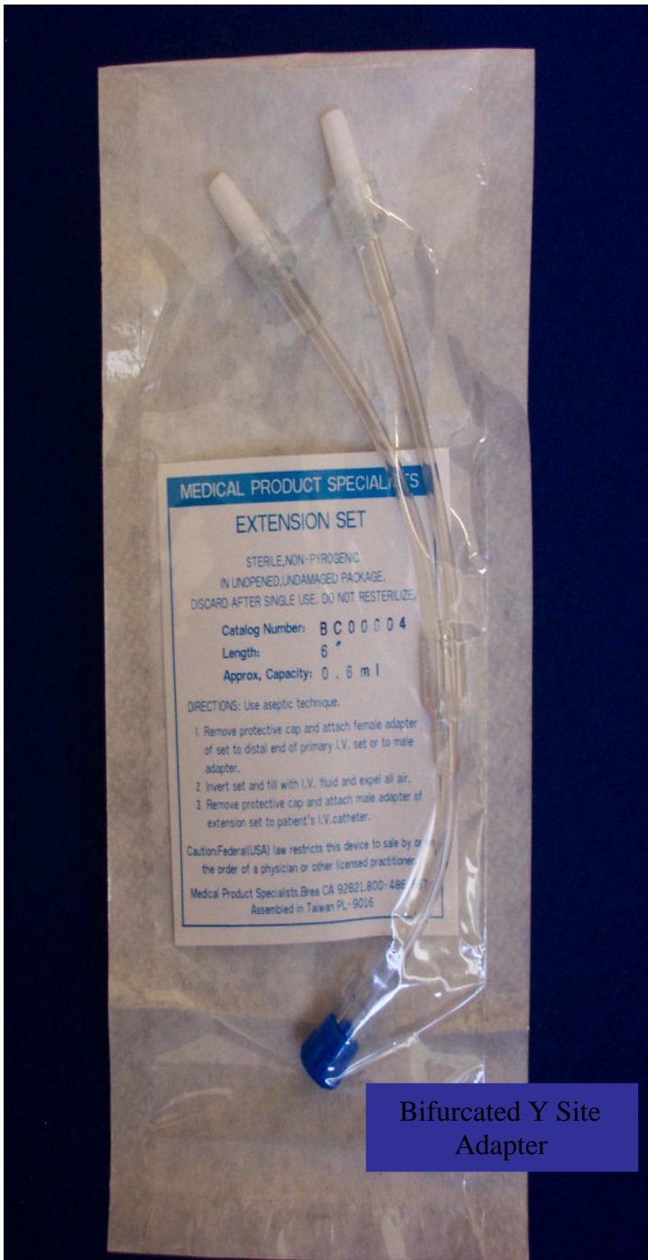
Bifurcated Y Site Adapter