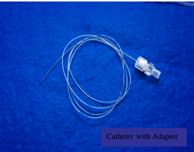
Catheter with Adapter

CATHETERS Epidural Catheters (with adapter) are supplied as standard with Accufuser Kits. Specialist Catheters can be supplied with 2.5" or 5" Fenestration as required.