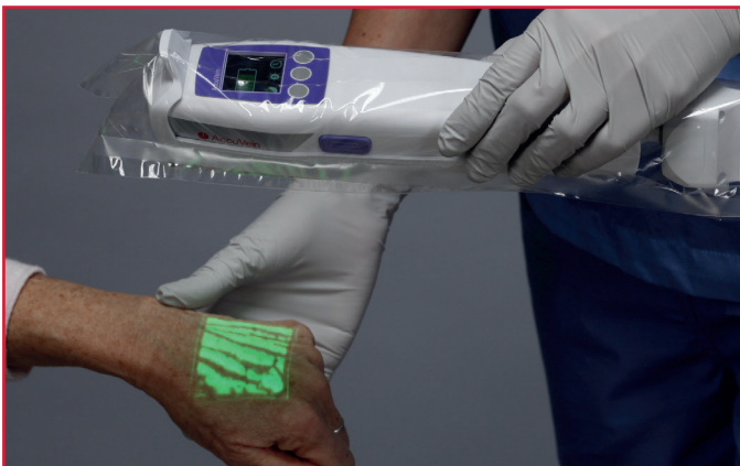
AccuVein Cover Part Number CL025

Hands-free choice. Rapid handheld assessment quickly converts to hands free.