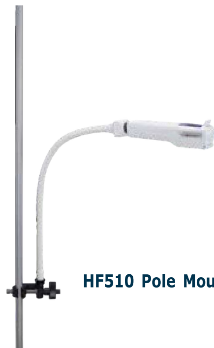
HF510 Pole Mount Arm