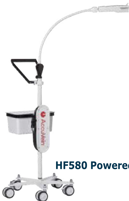
HF580 Powered Stand

Whether you're working chairside, bedside, or in a fast-paced environment, our stands and mounting options are designed to support efficiency, consistency, and better patient experiences.